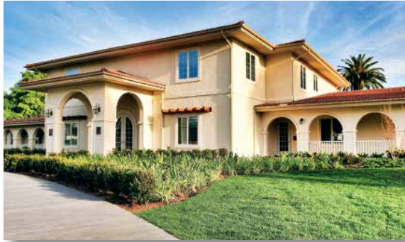
Greater Los Angeles Fisher House

A Fisher House is “a home away from home” for families of patients receiving medical care at major military and VA medical centers. The homes are normally located within walking distance of the treatment facility or have transportation available. There are 62 Fisher Houses located in the United States and Germany.